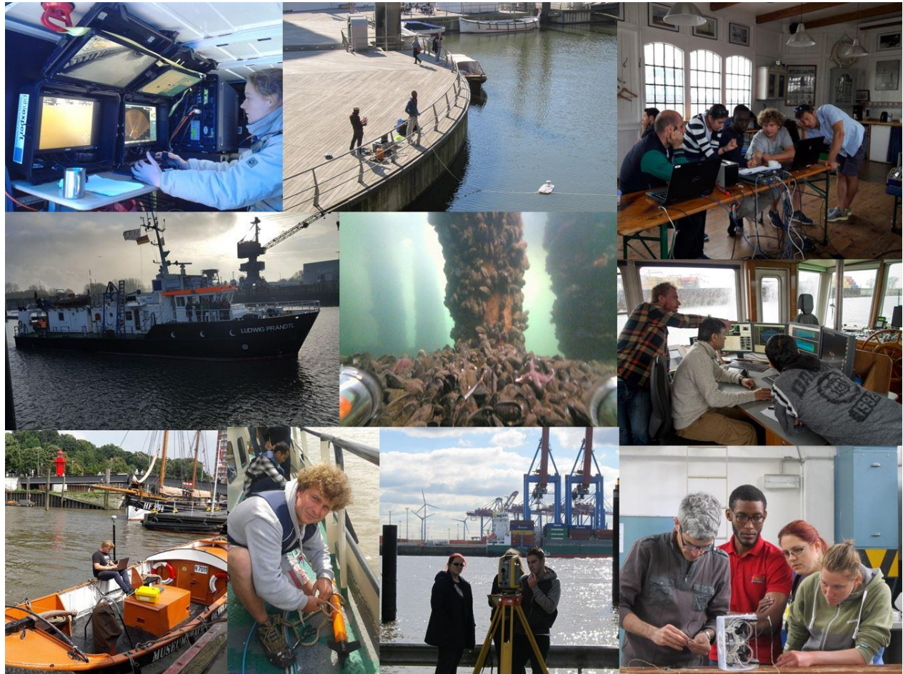
Figure 2: Students during practical courses and the final field training.

Currently, most of the systems and vessels used for the practical exercises belong to governmental authorities or institutes. The procedure for the construction of a new survey vessel for the university is ongoing. In Figure 3, a draft of the planned vessel is depicted. Besides the practical trainings for the students, the survey vessel will be used for research purposes. The vessel will have a length of about 8 m and a width of 2.5m so that it can be trailered easily to different lakes or rivers of interest. The vessel will be optimized for shallow water applications and will be equipped with a state-of-the-art multibeam echo sounder, sub-bottom profiler, single-beam echo sounder, side-scan sonar, magnetometer, inertial navigation system, and GNSS positioning. The mounting of these systems will be modular, so that they can be easily installed and exchanged depending on the task of a practical training or research topic. Borrowed equipment for detailed investigation or specific tasks can also be easily integrated into the vessel system. There will be space for up to four students in the cabin.